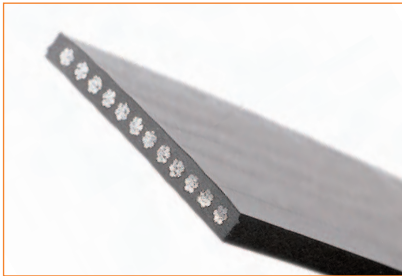
Gen2 coated-steel flat belts

Rather than manually counting surface wire breaks, as with traditional rope inspection, the Pulse system monitors the diameter of each cord contained in the Gen2™ coated-steel belts. A The electrical resistance of each cord is proportional to its cross-sectional area, which is a measure of its remaining useable life. The Pulse system continuously monitors this resistance to determine when the belts should be replaced.